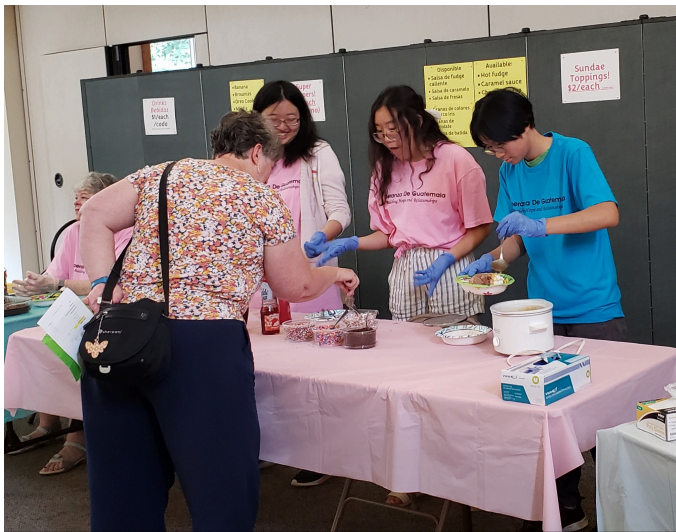
Our fundraising activity, Scoops for a Cause, to raise money for the water purification project.